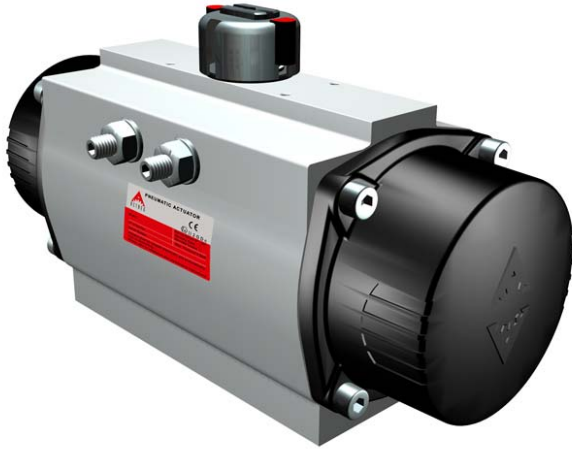
SPRING RETURN "ASR"