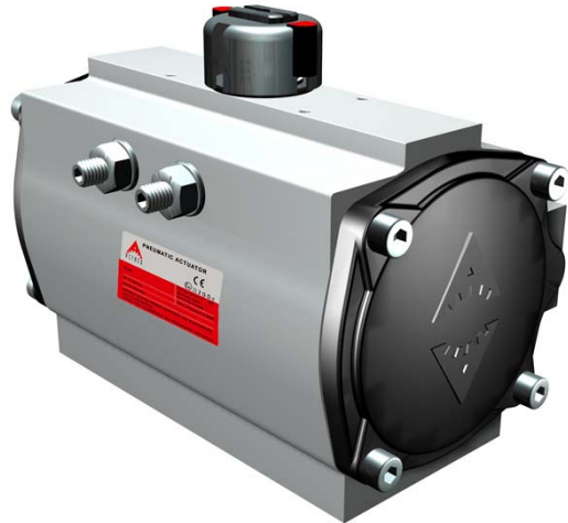
DOUBLE ACTING "ADA"